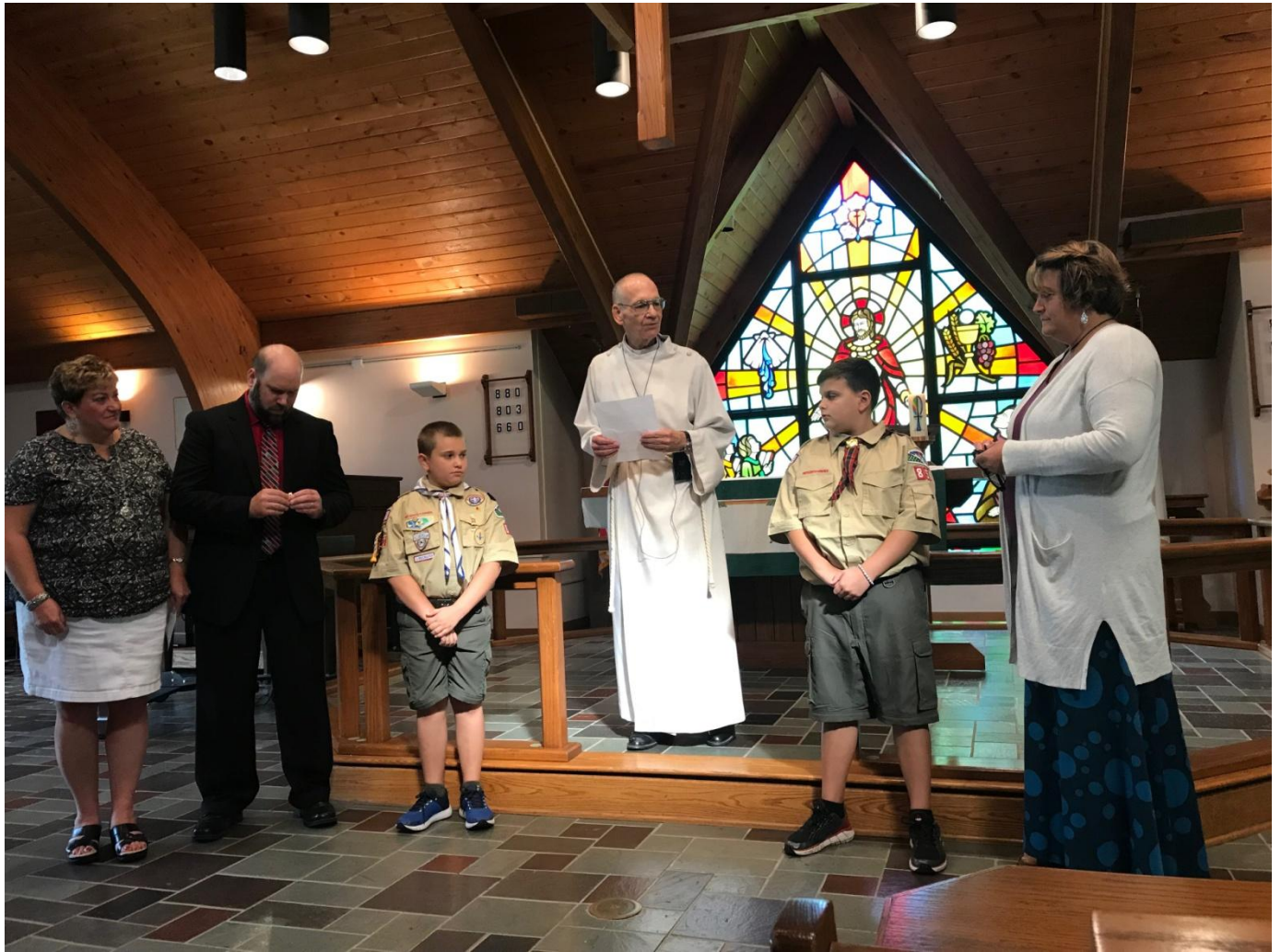
Boy Scouts God & Family Award Ceremony!!!